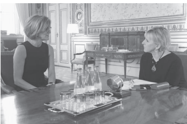
Talking with Minister Wallström in Stockholm, Sweden.