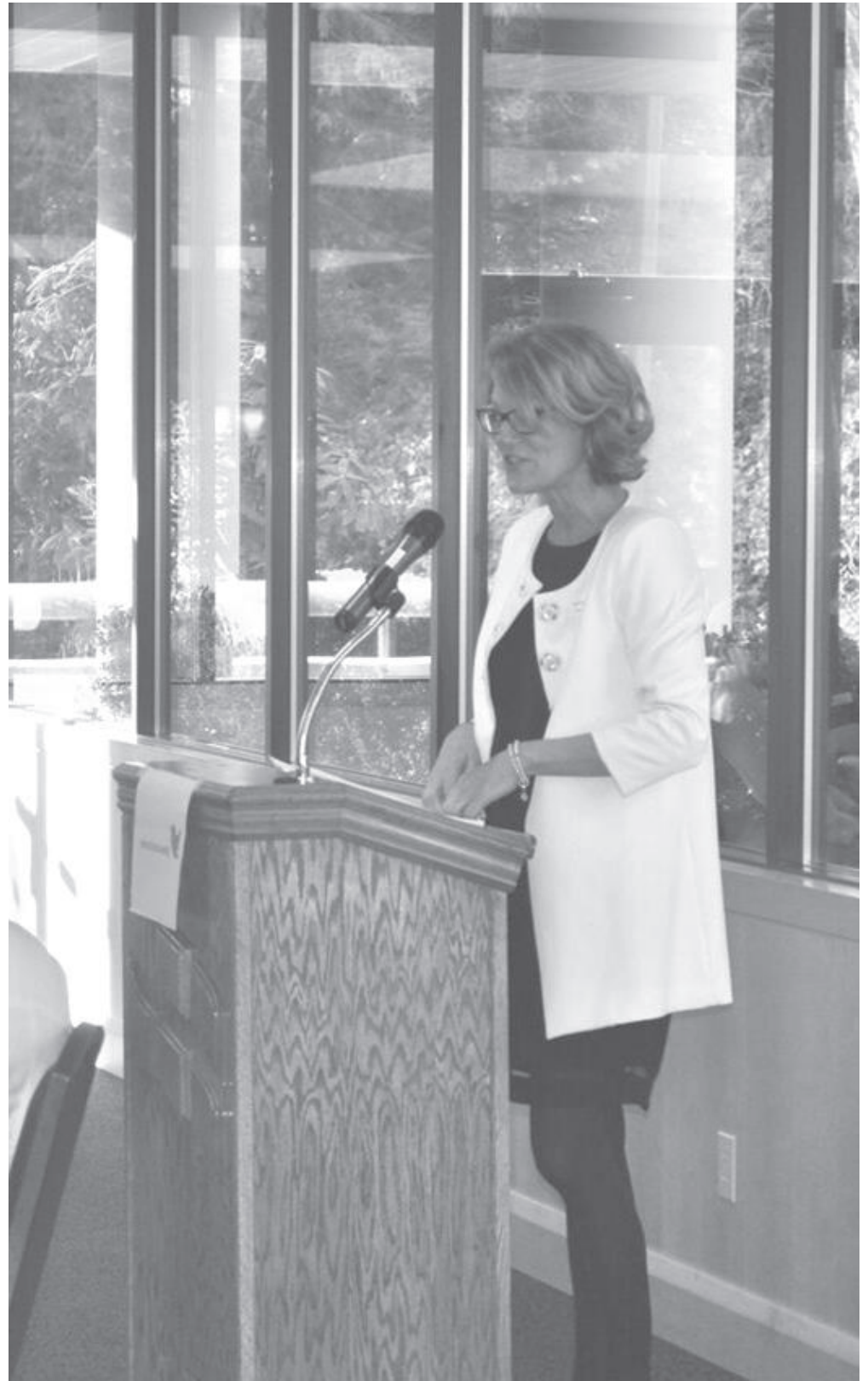
Pamela Goldsmith-Jones, M.P.