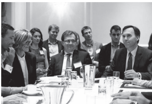
With Minister Morneau at a pre-budget consultation meeting in Vancouver.