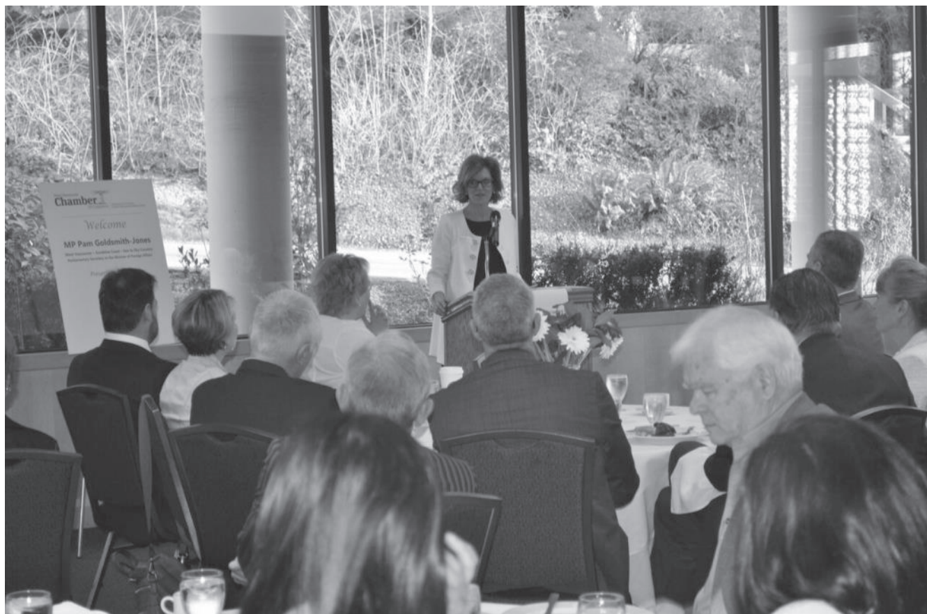
Presenting highlights from Budget 2016 to the West Vancouver Chamber of Commerce.

I have met with every elected council in the constituency now, and we are working closely to align budget requirements with federal funding, of course. The federal budget has money set aside to understand Vancouver's raging real estate market and what policies are needed that