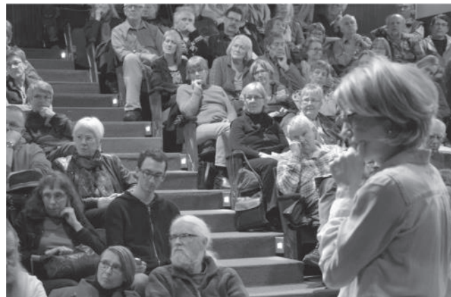
Conducting the town hall in Gibsons, BC.

While all 122 conditions are important to maintaining the proponent's accountability, I would like to highlight the following as these reflect the issues that were raised most