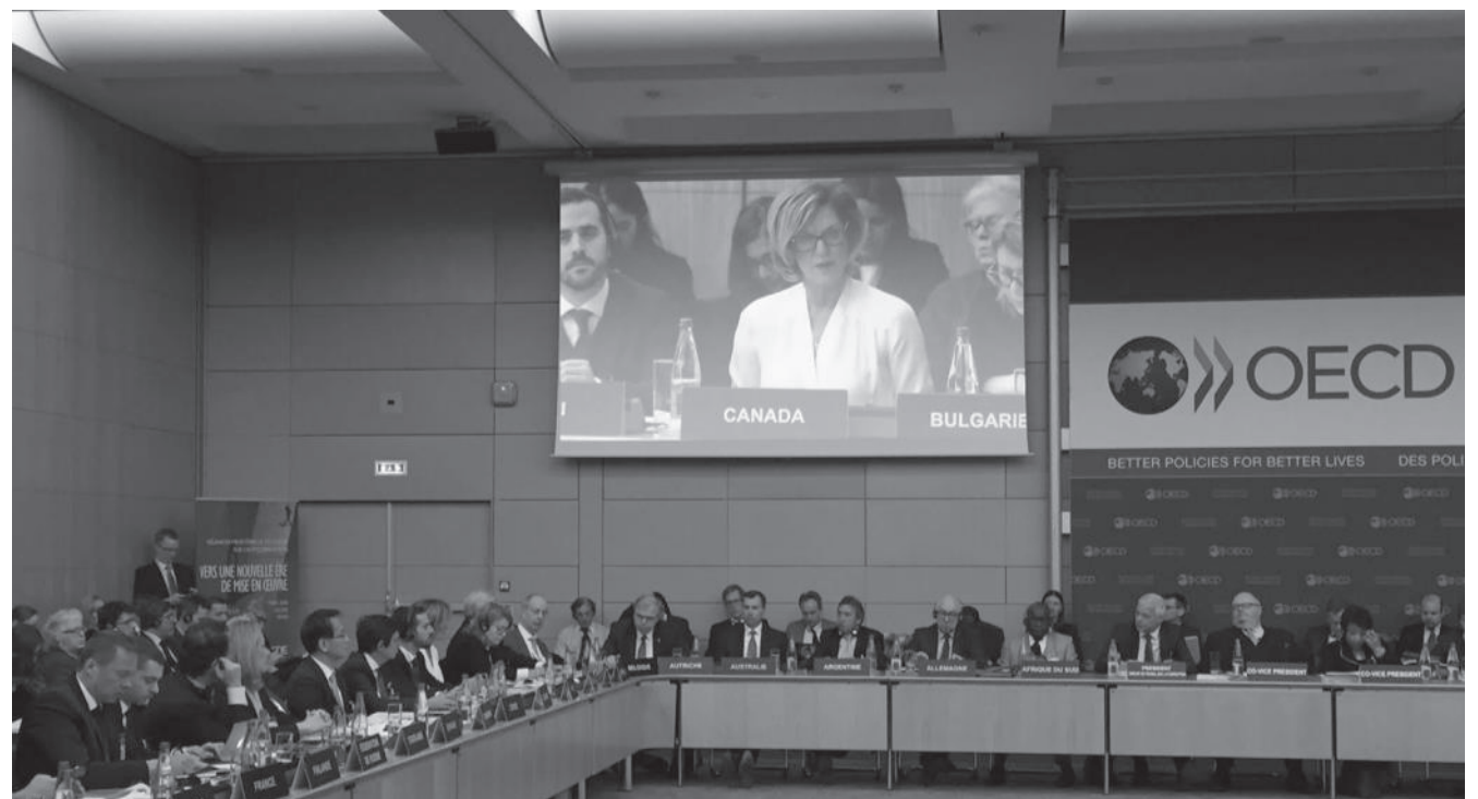
Participating in discussion as Canada's representative at the OECD Anti-Bribery Convention in Paris.

The meeting was co-chaired by US Attorney General Loretta Lynch. It was wonderful to meet her and to contribute to improving bilateral relationships with the US and with the eight other countries whose Ministers of Foreign Affairs or Justice I was able to meet with, one on one.